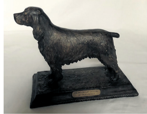
Trophy given to each of the Reserve CC winners