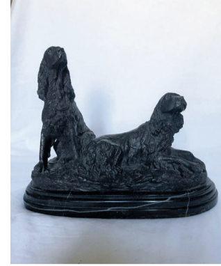
Trophy for Dog CC