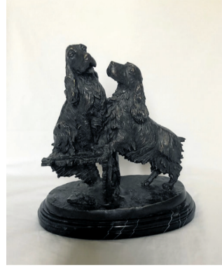
Trophy for Bitch CC