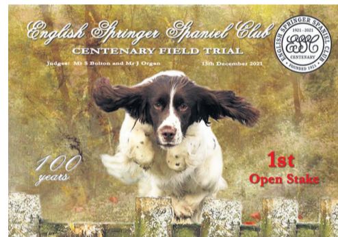
Field Trial Prize Card