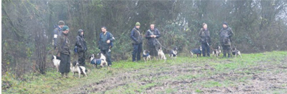
Dec ESSC Open FT - Competitors for the Open Trial waiting to be called in by the Judges for their second run