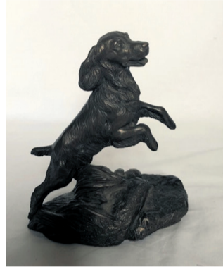
Trophy given to Best Puppy