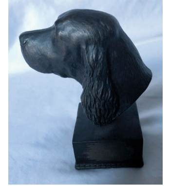
Trophy given for Best Veteran