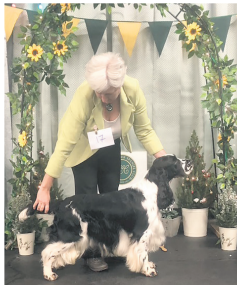
December Championship Show - Best Black & White in the photo booth